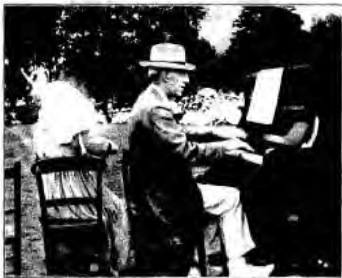
(5) CECIL SHARP PLAYING THE PIANO